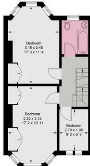
First Floor 550 sq ft / 51.1 sq m

This plan is not to scale and must be used as layout guidance only. All measurements and areas are approximate and should not be relied upon to provide accurate information. This plan must not be relied upon when making property valuations, design considerations or any other such relevant decisions. We accept no responsibility or liability (whether in contract, tort or otherwise) in relation to any loss whatsoever arising from or in connection with any use of this plan or the adequacy, accuracy or completeness of it or any information within it.