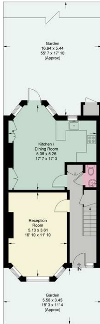
Ground Floor 556 sq ft / 51.7 sq m