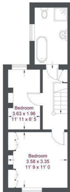
First Floor 354 sq ft / 32.9 sq m