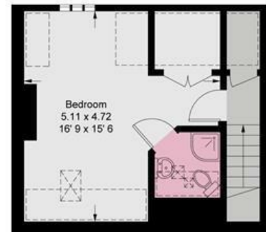
Second Floor 317 sq ft / 29.5 sq m (Including Reduced Headroom)