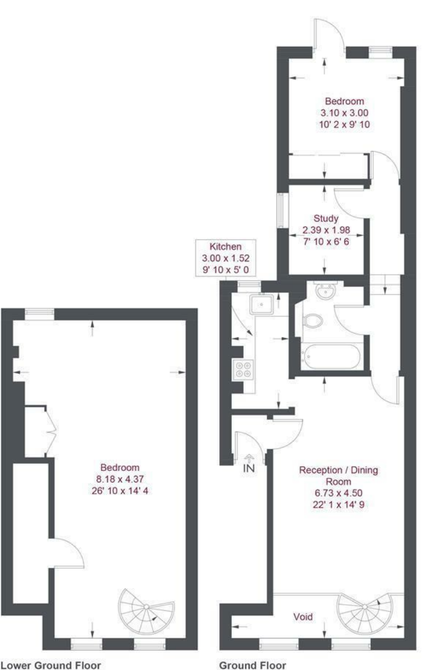
Lower Ground Floor 381 sq ft / 35.4 sq m