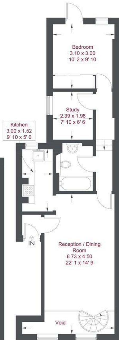
Ground Floor 536 sq ft / 49.8 sq m (Excluding Void)