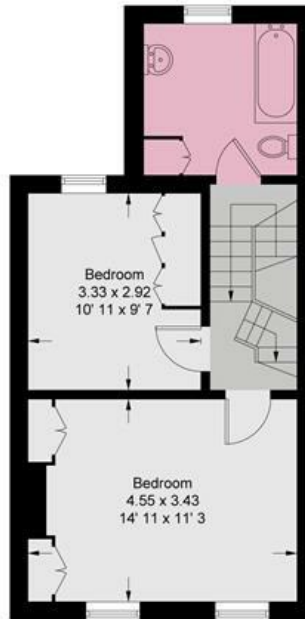
First Floor 418 sq ft / 38.8 sq m

This plan is not to scale and must be used as layout guidance only. All measurements and areas are approximate and should not be relied upon to provide accurate information. This plan must not be relied upon when making property valuations, design considerations or any other such relevant decisions. We accept no responsibility or liability (whether in contract, tort or otherwise) in relation to any loss whatsoever arising from or in connection with any use of this plan or the adequacy, accuracy or completeness of it or any information within it.