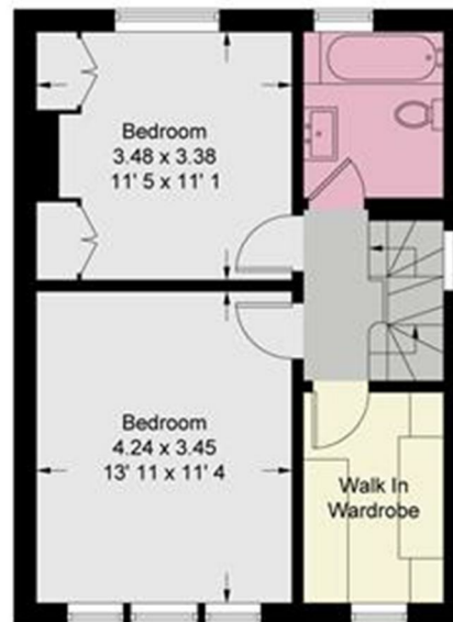
First Floor 463 sq ft / 43 sq m