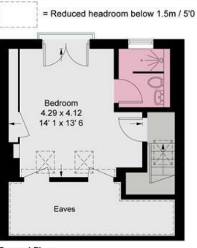
Second Floor 347 sq ft / 32.2 sq m (Including Reduced Headroom / Eaves)