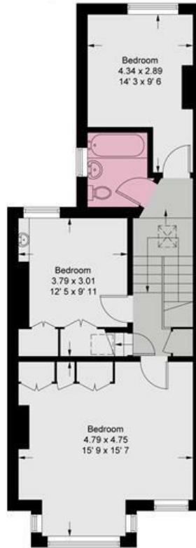
First Floor 599 sq ft / 55.7 sq m (Including Reduced Headroom)