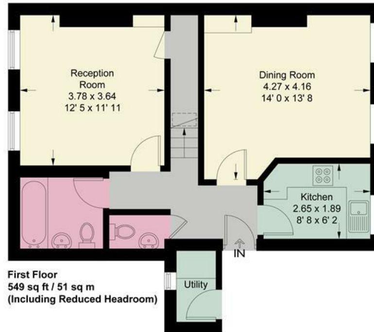
First Floor 549 sq ft / 51 sq m (Including Reduced Headroom)