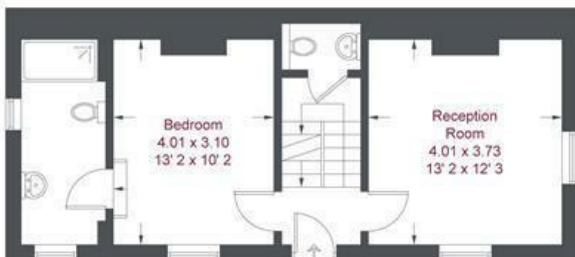
Ground Floor 452 sq ft / 42 sq m