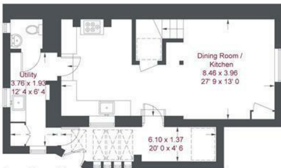
Lower Ground Floor 577 sq ft / 53.6 sq m (Including Reduced Headroom)