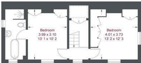
First Floor 450 sq ft / 41.8 sq m (Including Reduced Headroom)