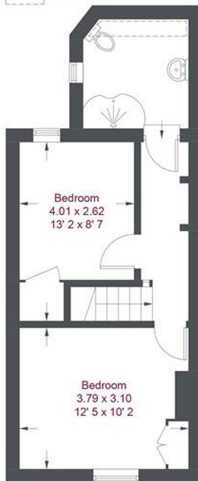
First Floor 366 sq ft / 34 sq m (Including Reduced Headroom)