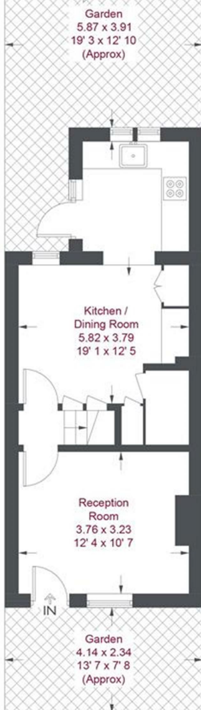
Ground Floor 369 sq ft / 34.3 sq m