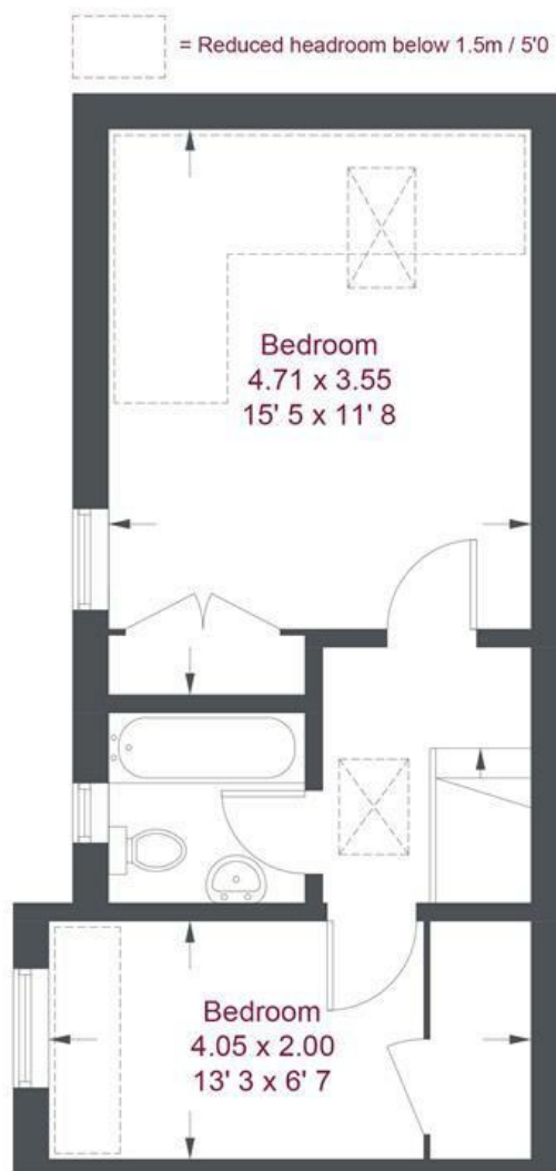
Second Floor 341 sq ft / 31.7 sq m (Including Reduced Headroom)